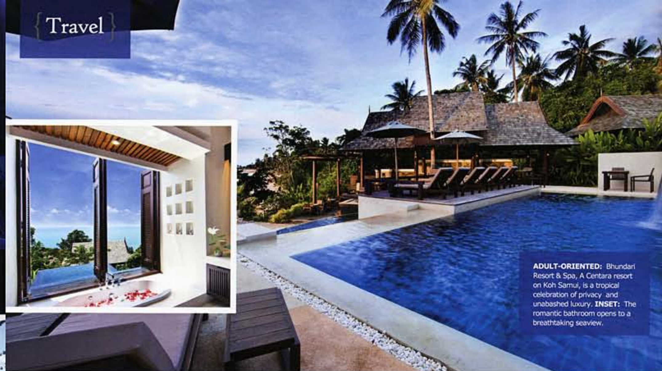
ADULT-ORIENTED: Bhundari Resort & Spa, A Centara resort on Koh Samui, is a tropical celebration of privacy and unabashed luxury. INSET: The romantic bathroom opens to a breathtaking seaview.