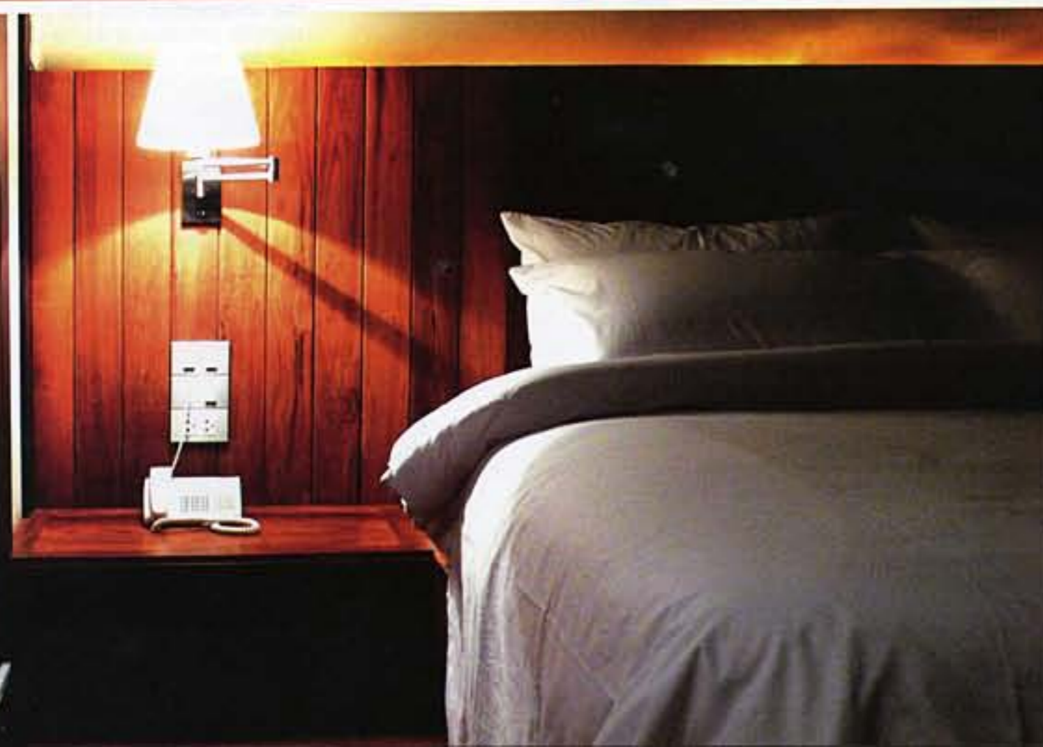
TOP: Dream Hotel Bangkok's bedroom is well, "dreamy." CENTER: Shapes, lines, and colors are everywhere at the designer boutique hotel on Samui, The Library. BOTTOM: Bangkok's LUX Hotel boasts an exclusive, intimate feel.