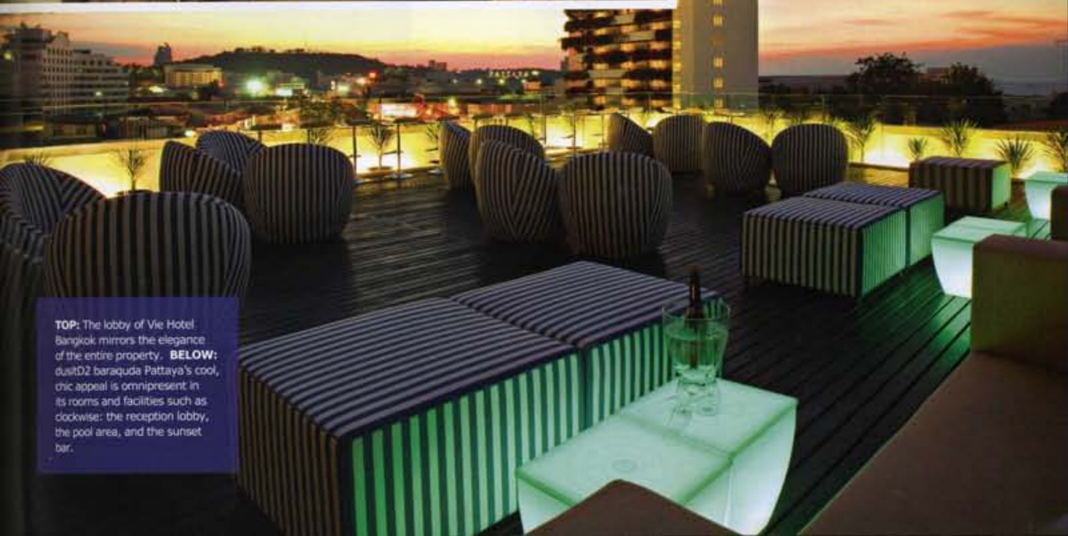
TOP: The lobby of Vie Hotel Bangkok mirrors the elegance of the entire property. BELOW: dualD2 baraquda Pattaya's cool, chic appeal is omnipresent in its rooms and facilities such as clockwise: the reception lobby, the pool area, and the sunset bar.

It's been a little less than 10 years since the boutique hotel trend in Thailand took off, and there has been no letting up. More and more boutique hotels – for a lack of a better term yet – are sprouting everywhere in the kingdom, with the common denominator of all being the relatively small size (nothing more than 200 rooms; some less than 20 rooms), intimate atmosphere, unique theme, and an obvious effort to stand-out apart from the rest.